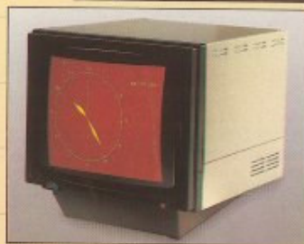
14" Metal Cabinet (MS) with plinth